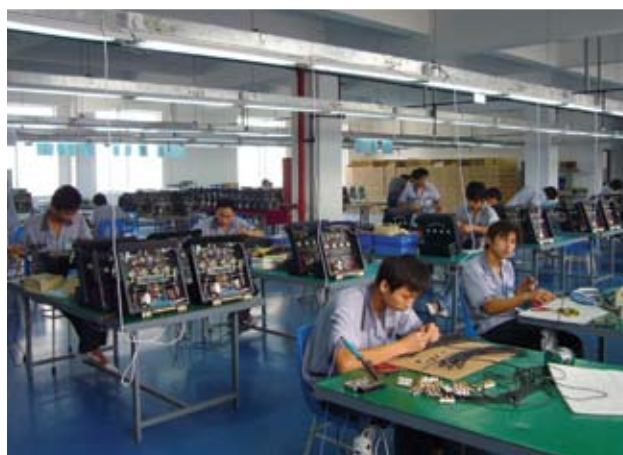
A factory floor during a production run of PrimaLuna amplifiers.