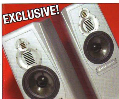
ADAM TENSOR GAMMA loudspeakers