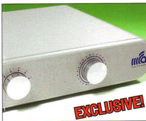
PRIMA LUNA PROLOGUE 8 CD player