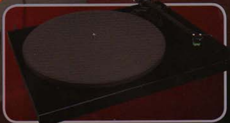
CAMBRIDGE AUDIO The first-ever turntable