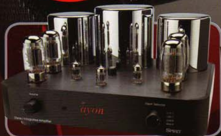
AYON AUDIO New valve revolution