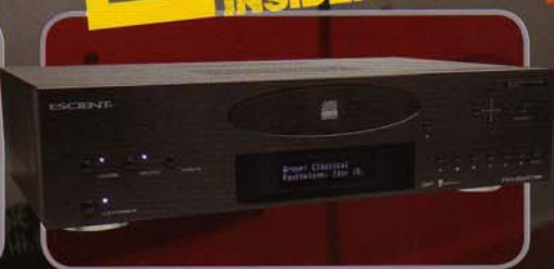
ESCIENT FIREBALL Recorder holds 1,500hrs!