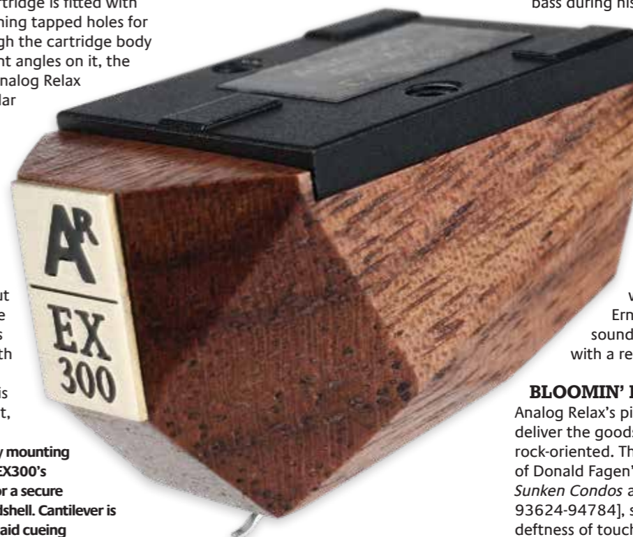
RIGHT: Threaded alloy mounting plate is fixed atop the EX300's faceted walnut body for a secure connection to the headshell. Cantilever is sufficiently exposed to aid cueing

Analog Relax's pick-up continued to deliver the goods with music a little more rock-oriented. The funk-infused bass line of Donald Fagen's 'Miss Marlene', from his Sunken Condos album [Reprise Records 93624-94784], skipped along with a deftness of touch that kept the track