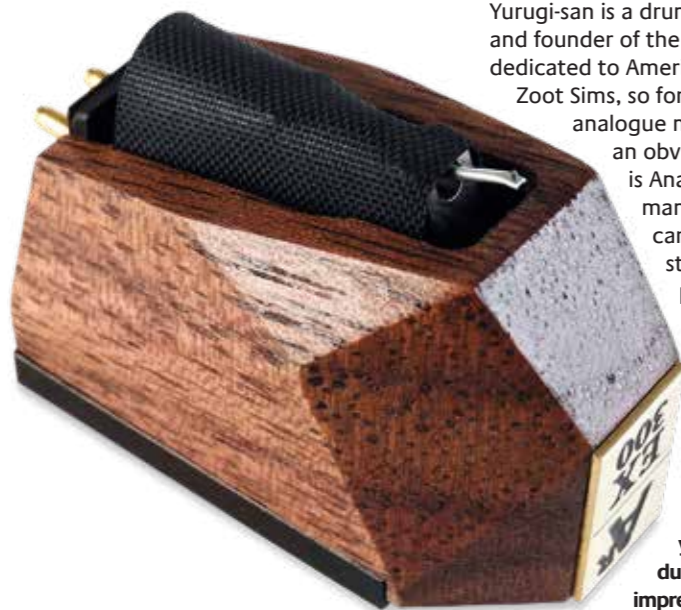
LEFT: Alloy cantilever is clear to see here [and see boxout, p57], while the coils and magnet yoke are screened from dust, and more, behind an impregnated fabric cover

The brand was set up by Yasushi Yurugi, who describes himself as loving 'analogue records and coffee more than anything else' and admits to having a collection of several thousand records and eight turntables – a man after my own heart.