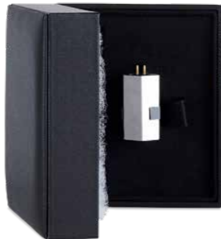
ABOVE: Utilitarian, certainly, but Analog Relax's soft-covered case and alloy stylus cover offer belt-and-braces protection!