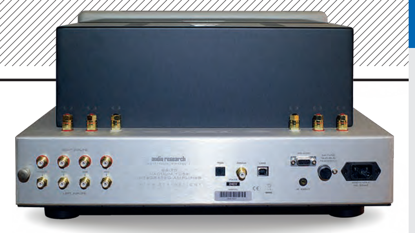
ABOVE: MM/MC phono and three line ins (on RCAs) are joined by optical, coaxial and DSD-ready USB digital inputs. The 4mm speaker connections have 8 and 4ohm taps

I worked my way through college in Orono, Maine, selling hi-fi systems to that track 43 years ago. I heard it at least 100 times in six months. The GSi75 peeled away a layer to let me hear tiny details I had somehow missed. Staying with music of that vintage and genre, I slipped in the Detroit Emeralds' 'Feel The Need' [Greatest Hits, Westbound CDSEWD 119 (CD); and Feel The Need, Atlantic K50372 (LP)].