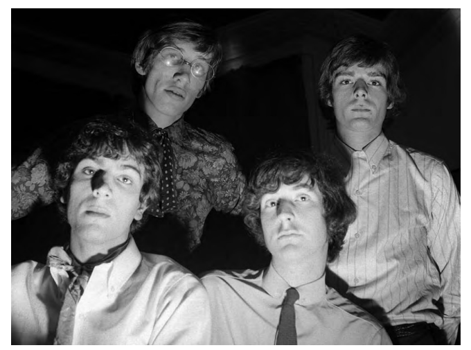
Pink Floyd (with shadow) 1967 20"x 16" - £395 (Inc VAT) 20" x 24"- £495 (Inc VAT) Edition of 50 in each size Fuji Matt Archival Paper C-Type Print