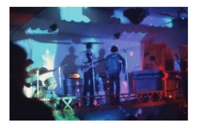
PF at UFO - 1 December 1966/January 1967 16 x 20 - £320 inc VAT 20 x 24 – £420 inc VAT 30 x 40 - £520 inc VAT Edition of 100 in each size Fuji Matt Archival Paper C-Type Print All prints are signed by the artist