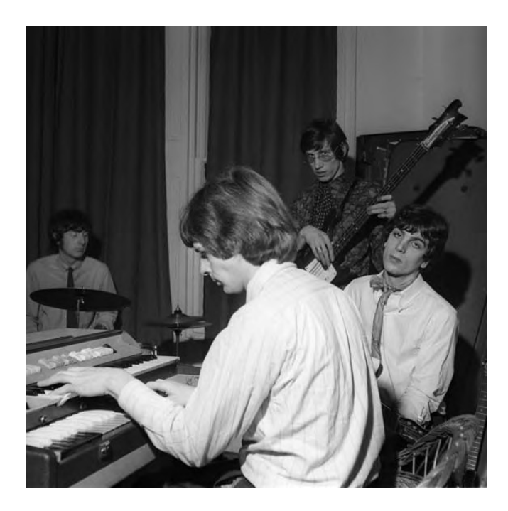
Pink Floyd (with keyboard) 1967 20"x 16" - £395 inc VAT 20" x 24"- £495 inc VAT Edition of 50 in each size Fuji Matt Archival Paper C-Type Print