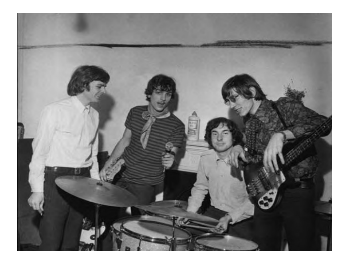
Pink Floyd (with drums) 1967 20"x 16" - £395 inc VAT 20" x 24"- £495 inc VAT Edition of 50 in each size Fuji Matt Archival Paper C-Type Print