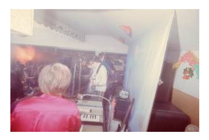
PF at UFO - 4 December 1966/ January 1967 16 x 20 - £320 inc VAT 20 x 24 – £420 inc VAT Edition of 100 in each size All prints are signed by the artist Fuji Matt Archival Paper C-Type Print