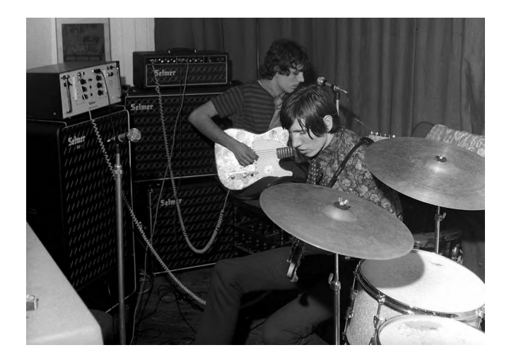
Pink Floyd (Syd & Roger) 1967 20"x 16" - £395 inc VAT 20" x 24"- £495 inc VAT Edition of 50 in each size Fuji Matt Archival Paper C-Type Print