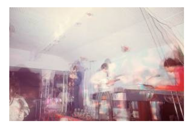
PF at UFO - 5 December 1966/Jan 1967 16 x 20 - £320 inc VAT 20 x 24 – £420 inc VAT Edition of 100 in each size All prints are signed by the artist Fuji Matt Archival Paper C-Type Print