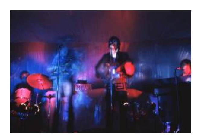
The Architectural Association Christmas Ball, 1966 16 x 20 - £320 inc VAT 20 x 24 - £420 inc VAT 30 x 40 - £520 inc VAT Edition of 100 in each size Fuji Matt Archival Paper C-Type Print All prints are signed by the artist

"The Roundhouse was enormous and decrepit, packed with people in weird costumes looning about. There was an amazing feeling of a new community. Suddenly the audience was part of the show and they knew it. The music was now their music. The light show was extraordinary; something that most people had never seen before. It all came together at the IT launch; the music, the lightshows, the place, and the audience. It felt like the beginning of something that had never happened before." Adam Ritchie