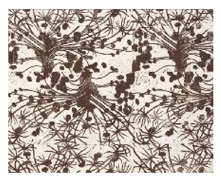
Untitled 14, 1964 Fine Art Prints, smooth white cotton rag 310GSM 24" x 20" - £180.00 Inc VAT Edition of 50 Numbered and stamped by the estate with Syd's signature.

Untitled 8, c. 1963 Fine Art Prints, smooth white cotton rag 310GSM 24" x 20" - £180.00 Inc VAT Edition of 50 Numbered and stamped by the estate with Syd's signature.