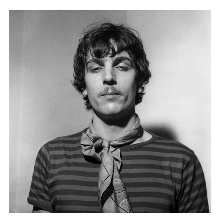
PR Shot (Syd with stripey shirt) 1967 20"x 16" - £395 inc VAT 20" x 24"- £495 inc VAT Edition of 50 in each size Fuji Matt Archival Paper C-Type Print