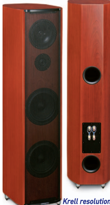
Krell resolution 2

Home Cinema Choice Best Amplifier of the Year