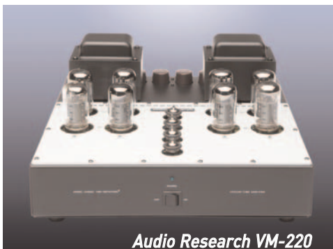
Audio Research VM-220

As Absolute Sounds settles into its second quarter-century, we've learned never to judge too hastily. Against all odds, the juggernauts that are home cinema, custom installation and multi-channel have not relegated two-channel to the audio