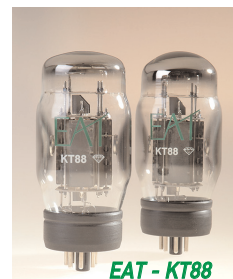
EAT - KT88

Hey, we didn't believe it either, at first. But now that we've tried the superb EAT replacement valves in everything from PrimaLuna amps to Audio Research and Jadis, we're convinced that they're worth every penny. "Sonically the results are absolutely superb" as quoted by Roy Gregory in Hi Fi Plus who awarded EAT with product of the year. If you use KT88s, 6550s, 300Bs or other popular output tubes, and your amp is due for re-valving, give us a call to discuss what the beautifully-made, fully matched and tested EATs can do for your system.