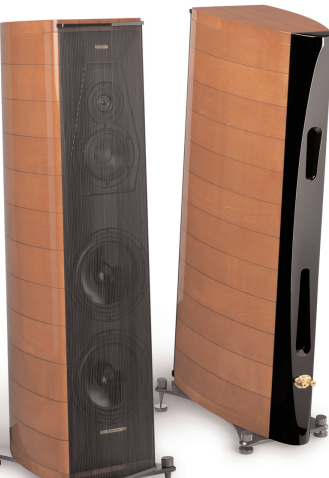
Sonus Faber - Amati Anniversario

The Cremona range, which as you all know, sits in between the Homage and Domus series, continues with its awesome Cremona floor