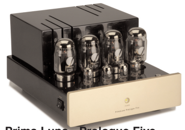
Prima Luna - Prologue Five