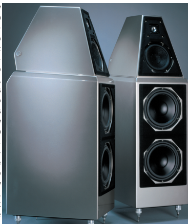
Wilson - System 7

Transparent has over the many years of exclusive partnership with Absolute Sounds rewarded the most demanding audio enthusiast with cables that assure nicest system connection with the greatest respect to music. From The Link to Opus, Transparent offers connections to fit all budgets and all audio and video applications. This year sees the launch of the new Power Isolator with a 20 amp IEC connection and 2 hospital grade outlets to boost your system performance. Also a nice powerbank for plasma users to assure you clean mains supply for a truly better picture. Another new Power product the high-performance PowerLink mains power cord. Last but not least, Transparent has finally launched a high-performance HDMI cable. All Transparent users should contact their dealer to participate in the upgrade program, can choose to go 1 or 2 steps up in the brand accompanied with a little expenditure, reflecting Transparent's continuous commitment to their customers.