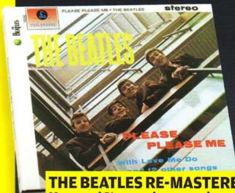
THE BEATLES RE-MASTERED Mono and Stereo releases reviewed

The Beatles Box Set – Worth the wait? Read our Verdict + Re-mastering the music – behind the scenes at Abbey Road