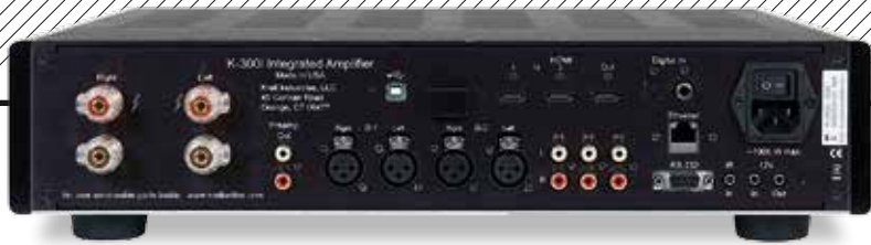
ABOVE: No phono stage here as the K-300i services five line ins (three on RCAs and two balanced on XLRs). The optional digital card adds USB-B, coax and optical digital plus HDMI (up to 192kHz and DSD128) and a network streaming via a mobile app

SACD/DSD 128], the magnificence of this remarkable recording is served well by the Krell amplifier's combination of sheer weight and speed. The sound is dramatic and yet fluid, with a big, expansive sense of ambience and presence, and a totally natural-sounding arrangement of the musicians in a sharply-focused soundstage.