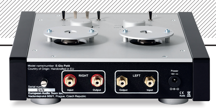
ABOVE: Simplicity itself – single gold-plated RCAs for connection to the tonearm leads and out to your choice of (pre) amplifier. Note \pm 18V DC PSU input socket

drug-addled brain might read more into it than The Beatles intended, for this phono stage delights in conveying power and meaning.