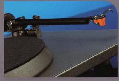
REGA Classic turntable now sounds better than ever