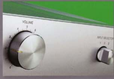
FLYING MOLE Latest digital amp is a sonic revelation