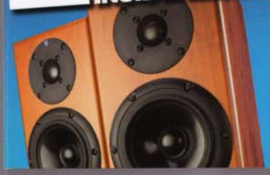
TOTEM Rainmaker speaker delivers music with gusto