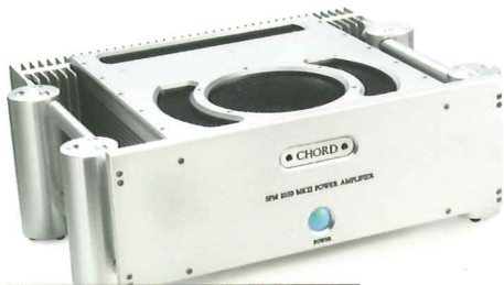
CHORD SPM 1050 MK II