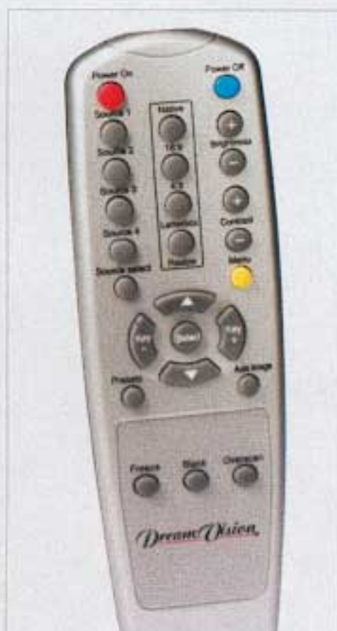
Simple yet very effective

P riced at £4,500, Dreamvision's new DLP projector, the Dreamweaver 2, certainly has the status to put its owners in an elite group. Sleek, smart and very sexy, the Dreamweaver 2 comes in a choice of white, silver or black finishes so it shouldn't have any problems blending in well with most living-rooms.