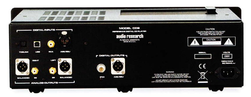
ABOVE: Balanced (XLR) and single-ended (RCA) analogue outputs are joined by USB, optical and coaxial S/PDIF and one AES/EBU digital input. Digital outs are offered too

It suggests that the CD9 can address differences in mastering, because that's all that should differ if the same musical performances are taken from the same master tapes. I do not want to belabour this: I merely wish to point out the possibilities for tweakers to fine-tune CD playback from the listening seat.