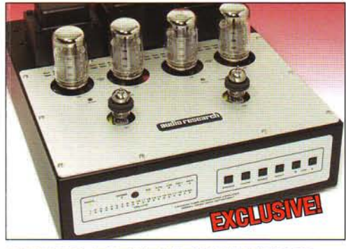
AUDIO RESEARCH VSi60 integrated amplifier