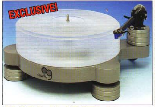
CLARO CLARITY 09 turntable

FREE READER CLASSIFIED ADS IN THIS ISSUE!