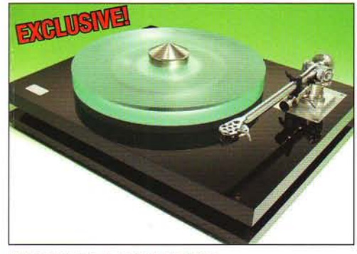
INSPIRE ECLIPSE turntable