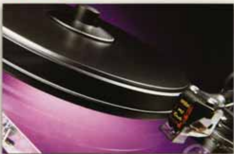
Turntable Pro-Ject Xpack