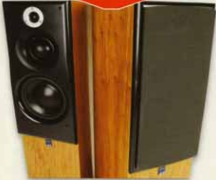
Loudspeaker ATC SCM40