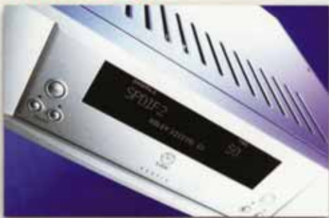
Multichannel Linn Exotik processor