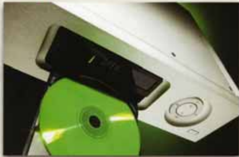
Universal player Ayre C-5xe