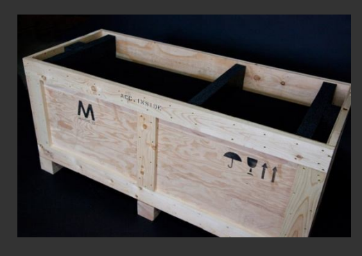
Remove crate lid and 3 pieces of interior foam.