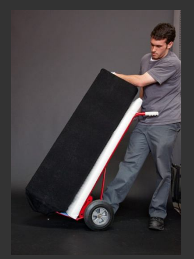
If it is necessary to move the speaker from the crate to the listening position, use a hand truck with a study piece of foam to protect the speaker.

Tilt Speaker up on to a soft surface, Make sure that back of speaker does not hit the crate and that the binding posts do not touch the floor.