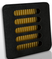
The superb Folded Motion™ tweeter.