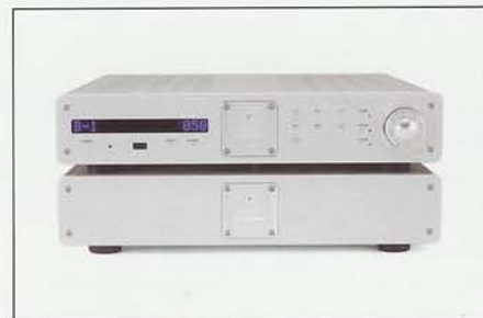
EVO-202 Stereo Preamplifier Evolution CAST, Krell Current Mode topology, balanced circuitry, menu display with remote control, separate power supply, RS-232, Theater Throughput. 17.3 x 7.6 x 18.3 in. 43.8 x 19.3 x 46.4 cm