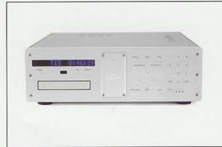
EVO-525 Progressive DVD/SACD/CD Player 1080p output via HDMI™, adaptive contrast enhancement, intelligent color remapping, frame-rate conversion, Evolution CAST, Krell Current Mode topology, balanced circuitry, RS-232 control, Crestron I²P, 12 VDC trigger. 17.3 x 6.3 x 17.3 in. 43.8 x 15.9 x 43.8 cm