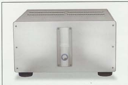
EVO-900 Monaural Power Amplifier 900 W, 1800 W (8, 4 Ohms) Evolution CAST, Krell Current Mode topology, Active Cascode Topology 17.3 x 9.8 x 26 in. 46.4 x 24.8 x 66 cm