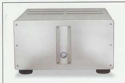
EVO-402 Stereo Power Amplifier 400 W, 800 W (8, 4 Ohms) Evolution CAST, Krell Current Mode topology, Active Cascode Topology 17.3 x 9.8 x 22 in. 46.4 x 24.8 x 55.9 cm