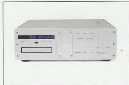
EVO-505 SACD/CD Player Krell-designed DAC reconstruction filters, Evolution CAST, Krell Current Mode topology, balanced circuitry, multi-channel output, RS-232 control, 12 VDC trigger. 17.3 x 6.3 x 17.3 in. 43.8 x 15.9 x 43.8 cm