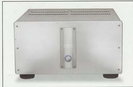
EVO-600 Monaural Power Amplifier 600 W, 1200 W (8, 4 Ohms) Evolution CAST, Krell Current Mode topology, Active Cascode Topology 17.3 x 9.8 x 22 in. 46.4 x 24.8 x 55.9 cm