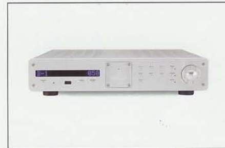
EVO-222 Stereo Preamplifier Evolution CAST, Krell Current Mode topology, balanced circuitry, menu display with remote control, RS-232, Theater Throughput. 17.3 x 3.8 x 18.3 in. 43.8 x 9.7 x 46.4 cm

Component dimensions are described by width x height x depth. All power ratings are per channel.