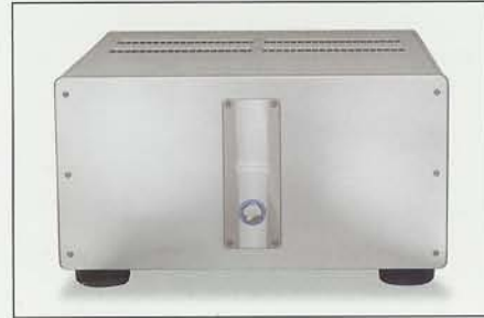
EVO-403 Three-channel Power Amplifier 400 W, 800 W (8, 4 Ohms) Evolution CAST, Krell Current Mode topology, Active Cascode Topology 17.3 x 9.8 x 26 in. 46.4 x 24.8 x 66 cm