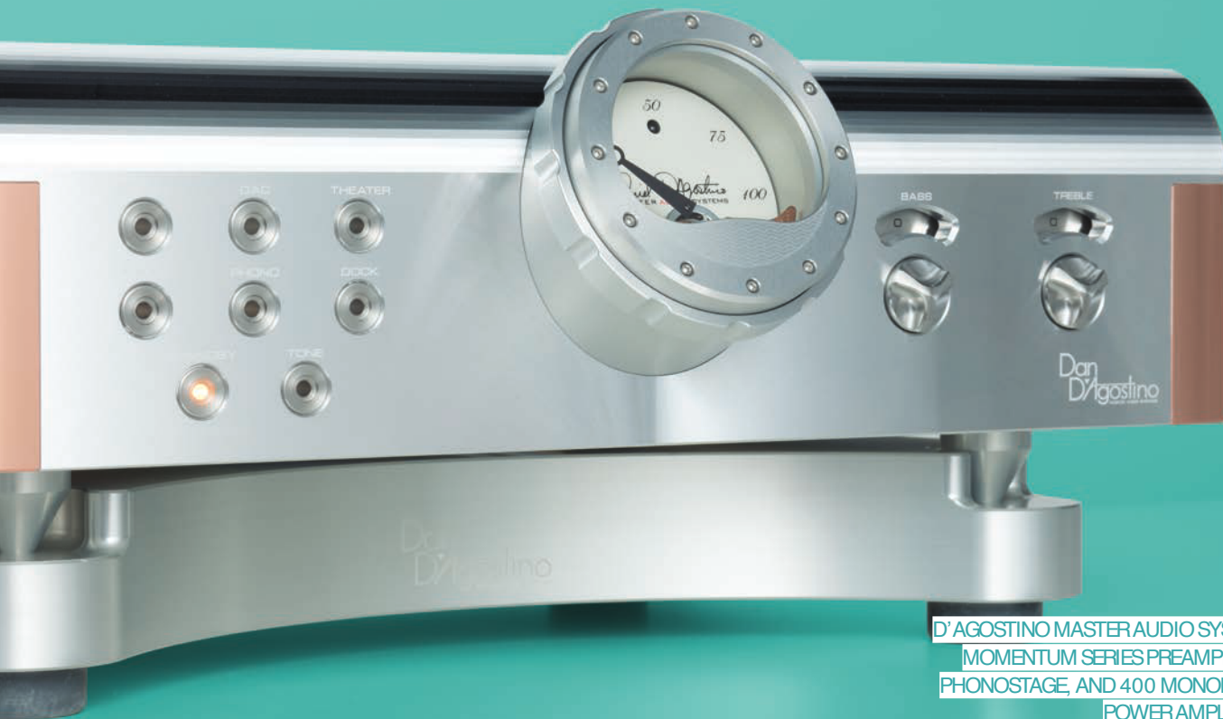
D'AGOSTINO MASTER AUDIO SYSTEMS MOMENTUM SERIES PREAMPLIFIER, PHONOSTAGE, AND 400 MONOBLOCK POWER AMPLIFIERS