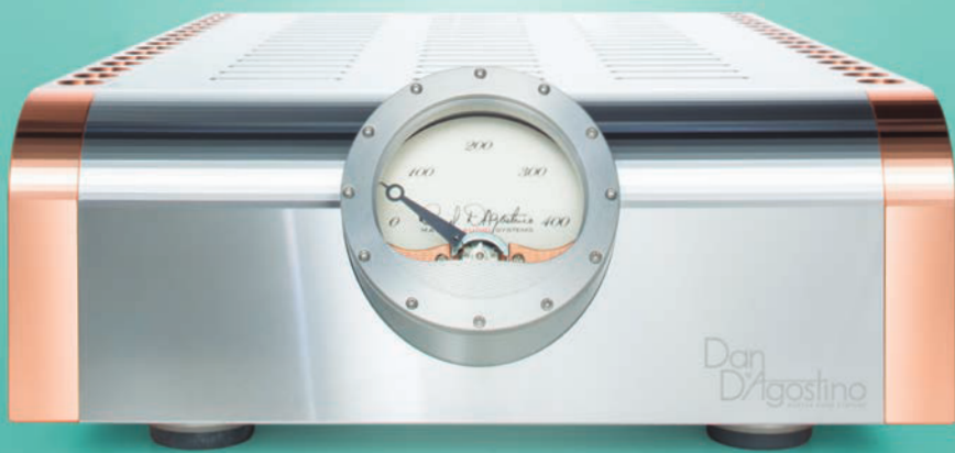
D'AGOSTINO MASTERAUDIO SYSTEMS MOMENTUM SERIES PREAMPLIFIER, PHONOSTAGE, AND 400 MONOBLOCK POWERAMPLIFIERS

phonostage has no fewer than 16 loading options, in addition to equalization curve selections—all available at the touch of a button. Finally, a special feature of the phonostage is that it permits you to add up to 6dB of gain to the standard settings for mc and mm inputs. (I didn't find this necessary given the abundant gain on tap with the preamplifier.)