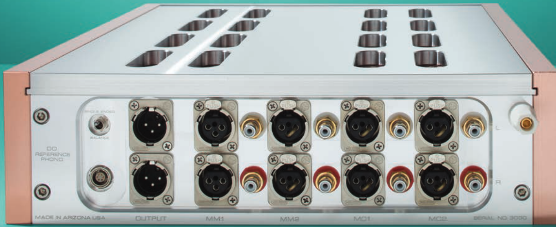
D'AGOSTINO MASTER AUDIO SYSTEMS MOMENTUM SERIES PREAMPLIFIER, PHONOSTAGE, AND 400 MONOBLOCK POWER AMPLIFIERS