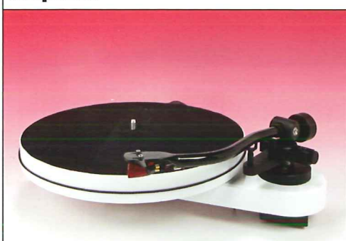
PROJECT RPM 1 CARBON turntable