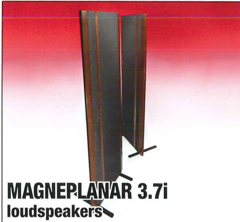
MAGNEPLANAR 3.7i loudspeakers

FREE READER CLASSIFIED ADS IN THIS ISSUE!