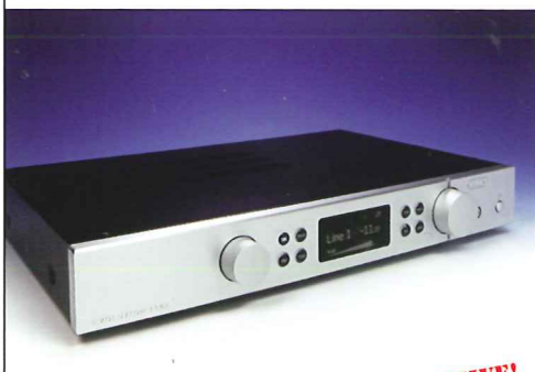
CREEK EVOLUTION 100A amplifier